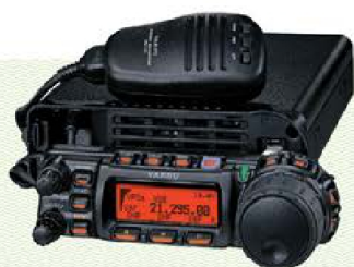
The Yaesu FT-857D is an HF mobile transceiver and offers 6 meters, 2 meters, and 70 centimeters.

If you intend to use your mobile transceiver indoors, you'll need a 13.8-volt dc power supply to run it. Look at the transceiver specifications and determine the maximum amount of current the radio will draw, in amps, when transmitting. Your power supply will have to deliver at least that much current. Most 50-watt FM/digital transceivers draw about 15 amps, while 100-watt HF radios draw about 25 amps. If you think you may someday be operating a 100-watt radio at home, go ahead and buy a power supply rated for 25 amps or more. Don't worry about providing too much current; the radio will only draw as much current as it needs.