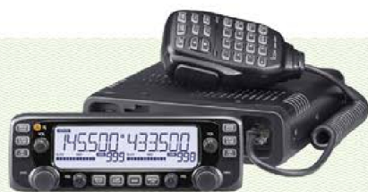
The Icom ID-4100A is a dual-band FM and D-STAR mobile transceiver. Note the detachable front panel.