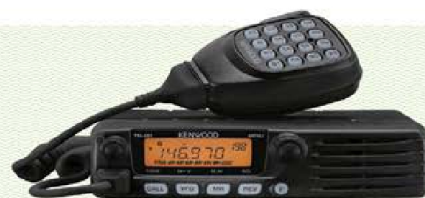
The Kenwood TM-281A is an example of a single-band (2 meters only, in this model) FM-only transceiver.