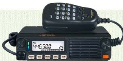
The Yaesu FTM-7250DR is a dual-band FM mobile transceiver that includes Yaesu's System Fusion digital mode.