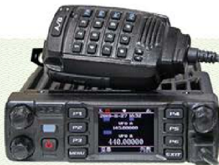
The AnyTone AT-D578UV is a dual-band FM and DMR mobile transceiver.